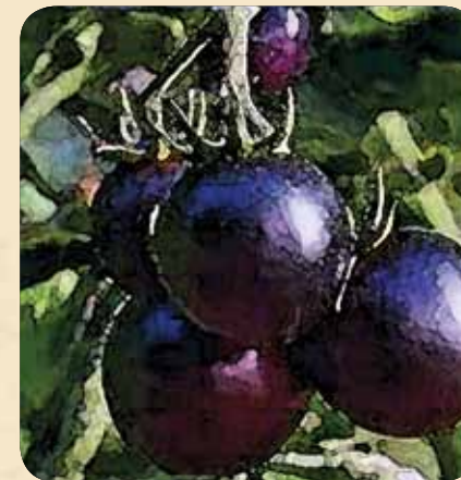
HELSING JUNCTION BLUE