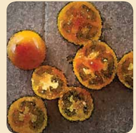
BIG SKY BRANDY